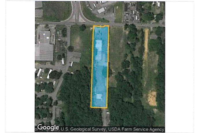
Aerial image of the property